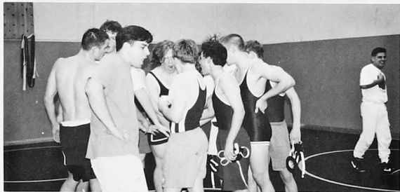
The team gathers for an after-practice shout to exercise their lungs.